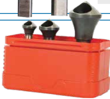
Alpha Countersink 3 Piece Set Cross Hole 90° HSS-Cobalt Part# C102827 $175.00 Each | ex GST