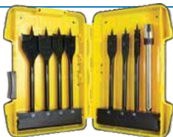
8pce Spade Bit Set Part# C107998 $42.70 Each | ex GST